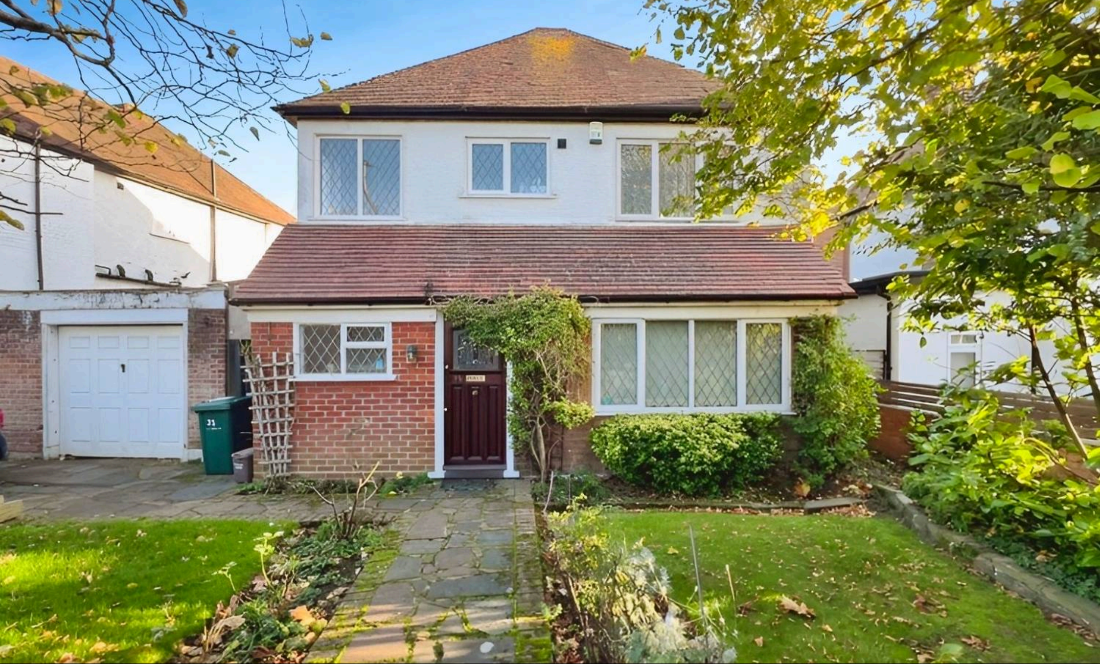
35 Lyndhurst Avenue, London £950,000